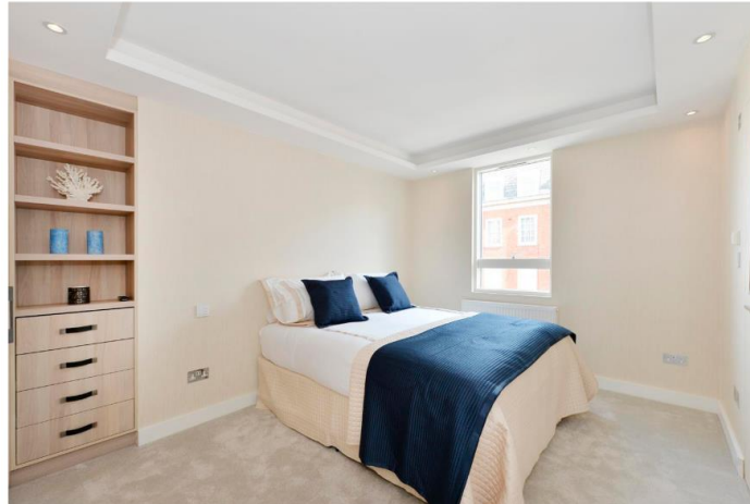
Macready House Approx. Gross Internal Area 852 Sq Ft - 79.15 Sq M